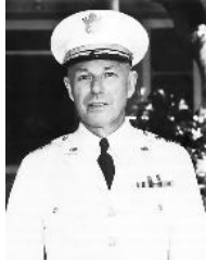
Lt. Gen. Walter S. Short