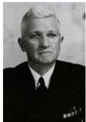
ADM Harold Stark