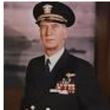
ADM Ernest J. King