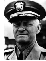
ADM Chester W. Nimitz