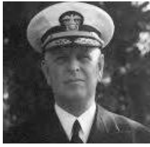
ADM Husband E. Kimmel