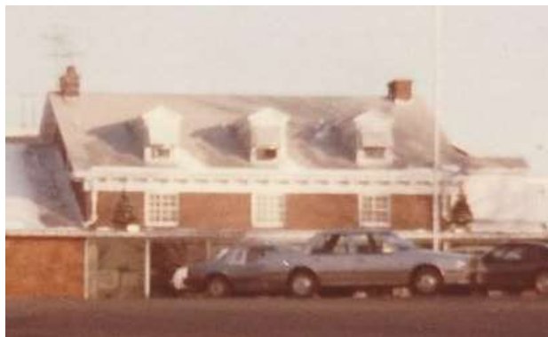
The above picture shows the three dormers that were integral to the apartment.

The apartment, which went through several configurations over the years, was quite spacious. The configuration shown includes four bedrooms, two bathrooms, a living room, and lots of storage. However, it did not include a kitchen or a dining room, as the family was presumably either fed by the Club or used the Club's kitchen.