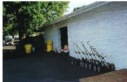
Arlington "Cart Barn" Circa 1967

If you wish to learn more about the history of the golf cart, go to the following website: https://www.golfcartsforsale.com/blog/history-of-the-golf-cart/ .